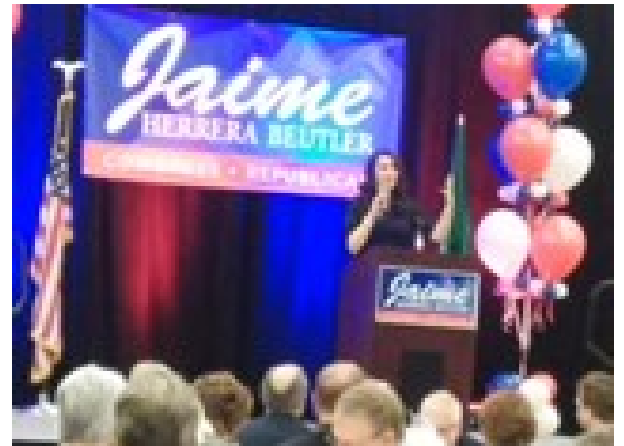
Pictured above Congresswoman Jaime Herrera-Beutler of Washington's 3 rd Congressional District addressing a crowd of 300 guests and supporters.

As Mankind becomes more liberal, they will be more apt to allow that all those who conduct themselves as worthy members of the community are equally entitled to the protections of civil government. I hope ever to see America among the foremost nations of justice and liberality. President George Washington