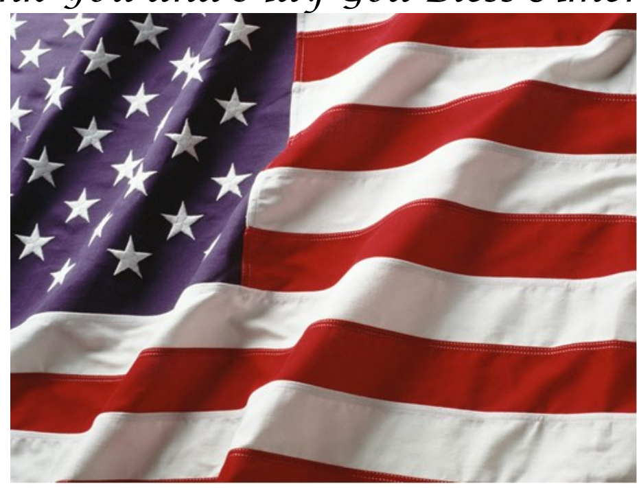
Never Forget September 11<sup>th</sup> Take some time and seek to serve others