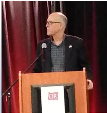
Congressman Greg Walden

https://www.eventbrite.com/e/5th-annual-equity-innovation-in-education-dinner-registration-59360567054