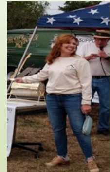
State Representative Christine Drazan pulling a winning raffle ticket at the event.